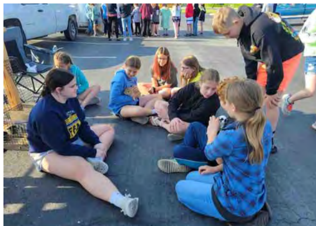
By: Rachel Haver

This year's 2024 petting zoo was held at the Faiveu Elementary school from 8:30 - 2:30. With over twelve different animals and amazing hands-on activities, this petting zoo brought tons of joy and even more laughs.