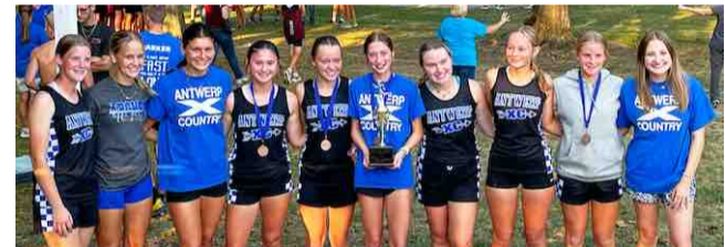
The Lady Archers prove to be the best at the County Cross country meet and as host!