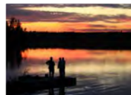
CANADIAN FISHING TRIP