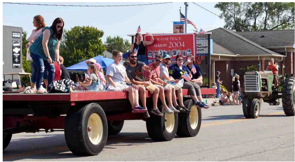
It's the 20th class Reunion for the Wayne Trace Class of 2024 at the Payne Rock the block in the parade, entertaining the crowds downtown!